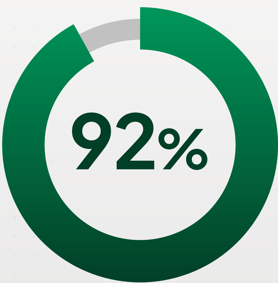
Ease of setup

According to customer reviews, 94% of reviewers recommend Keepit to their peers. Keepit also receives high praise and customer satisfaction for: